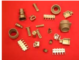
Plated Plastic Shielded Connectors