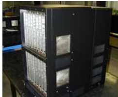
Plated Plastic Router Chassis