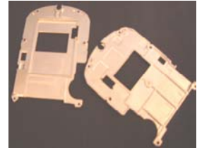
Plated Plastic PDA Shield