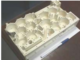
Plated Plastic RF Filter Housing