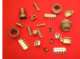
Plated Plastic Shielded Connectors