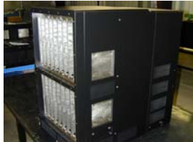
Plated Plastic Router Chassis